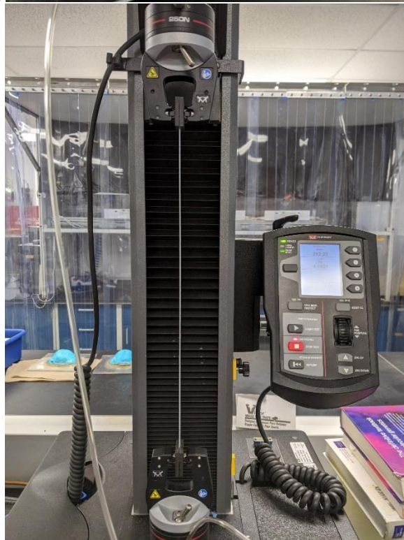
Figure 1. Laboratory Test Photos