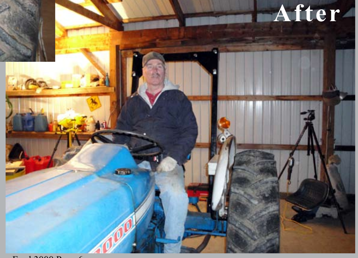
Ford 3000 Page 6