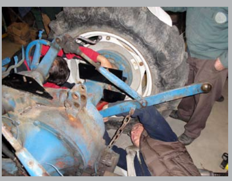
Steps 1-2 Installation of Parts 1-2