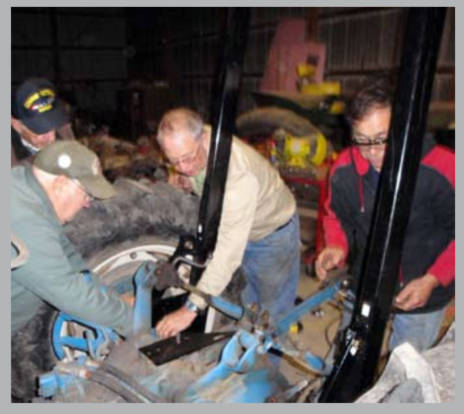
Steps 14-16 Front View