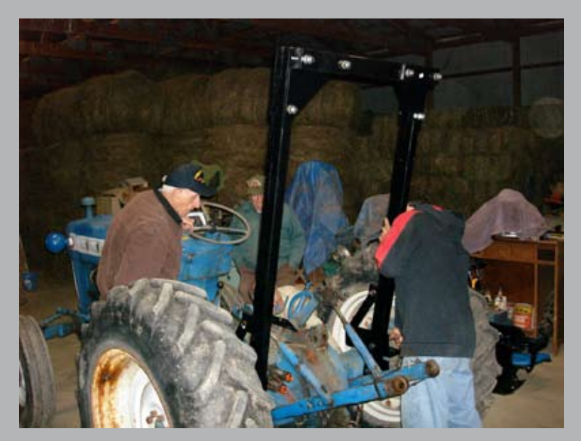
Steps 20-23 Proper Bolt Torque