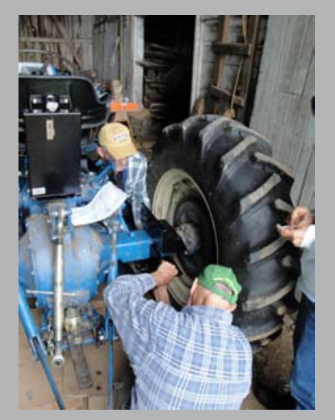
Steps 1-2 Installation of Parts 1-2