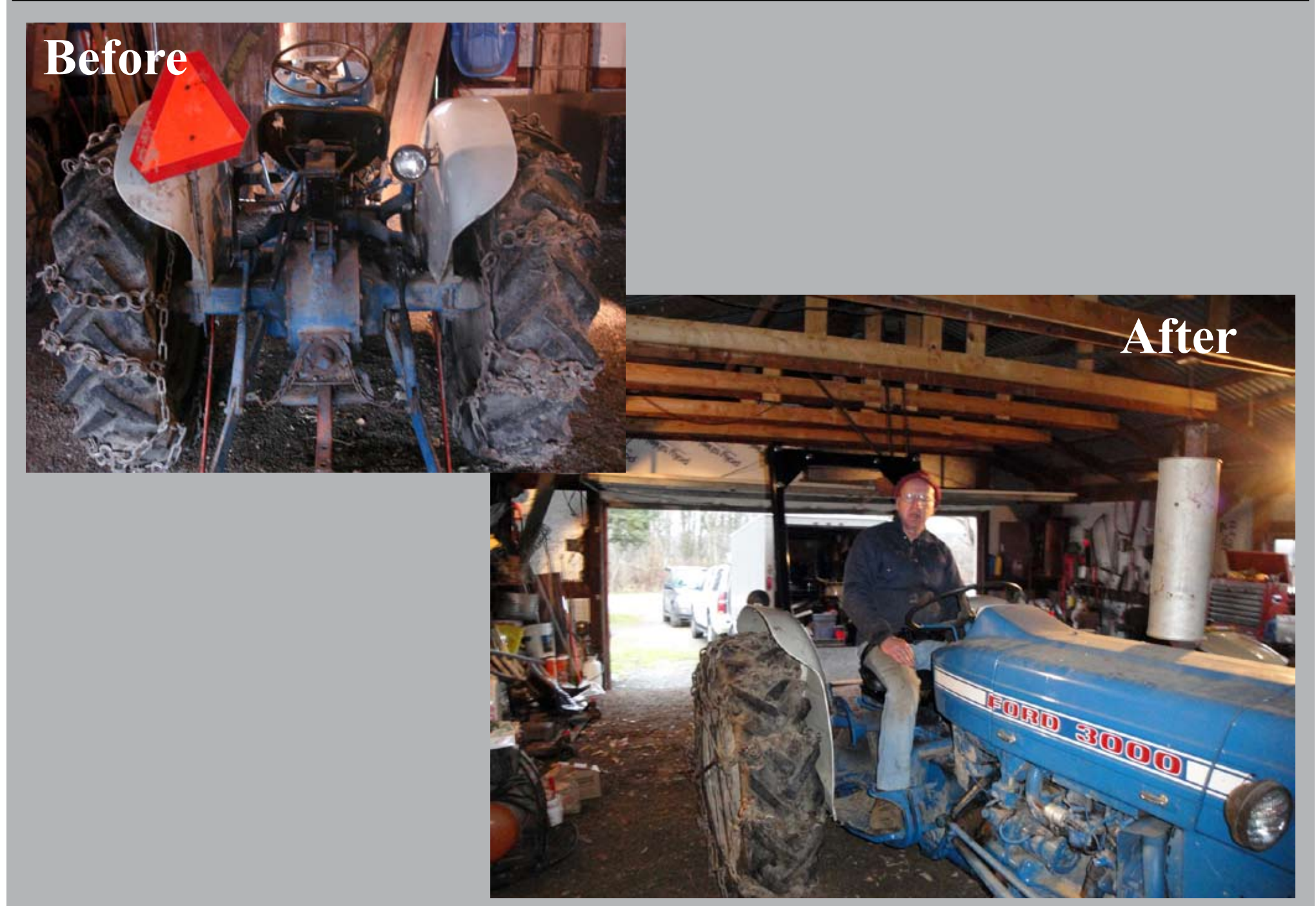
Ford 3000 Page 5