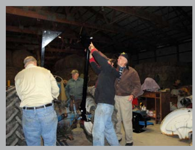
Steps 14-16 Rear View